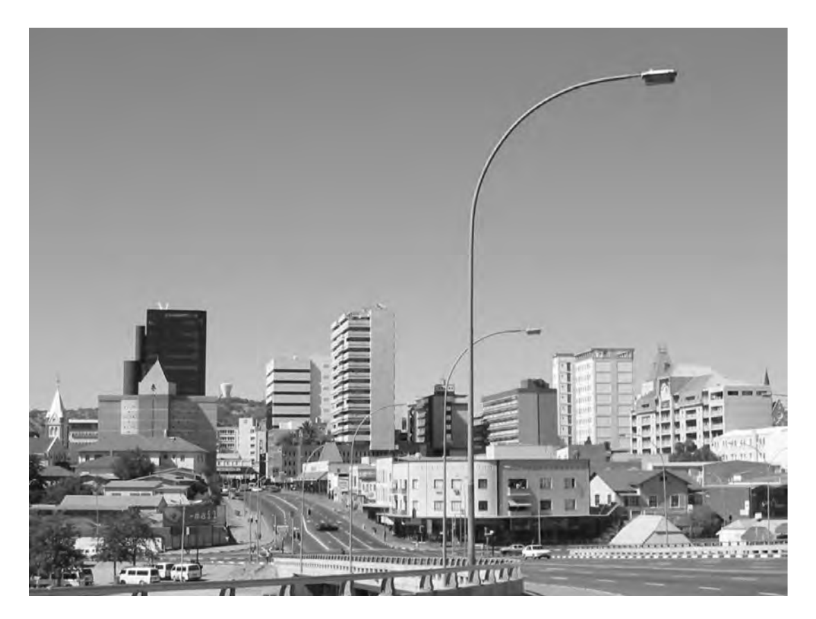
Photograph A for Question 7